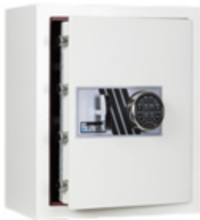
Burglary & 30 Minute Fire Protection Home & Small Office

Multifile is a leading supplier of Safes and Security Cabinets throughout Australia including Adelaide, Brisbane, Canberra, Darwin, Hobart, Melbourne, Perth and Sydney. Our goal is to provide Safes and security solutions for domestic and commercial applications - we are the safes specialist's.