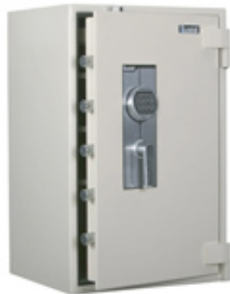
Burglary/Grinder Resistant 1 Hour Fire Protection Medium to Large Office