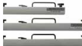
Multifile Premium Plan Clamp (3 sizes) A2, A1, A0