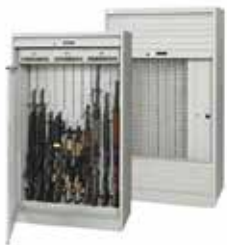
Tambour Door Cabinets