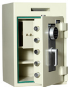
Deposit Security Safes