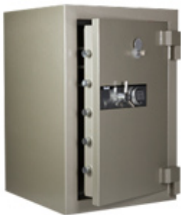
Maximum High Security for Jewellers & Banks