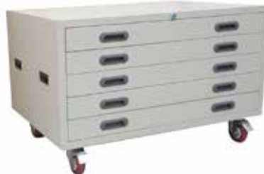
Lockable Horizontal Plan Cabinets A1+ AO, 5 Drawer