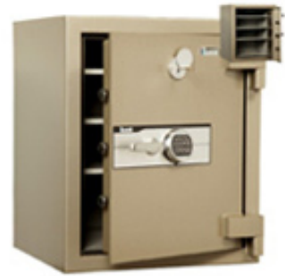
High Security Safes including 1 Hour Fire Protection