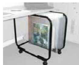
A3/A2 Storage / Plans, Job Bags. Underbench Trolleys Storage Cupboards