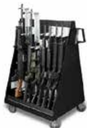
Mobile Weapons Storage