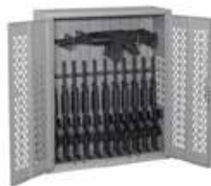
Stackable Weapons Lockers