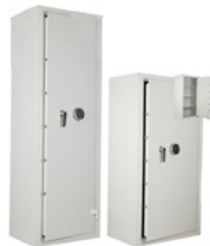
High Security Storage for: Supermarkets, Petrol Stations, Hotels (Till floats)