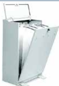
Vertical Plan Cabinets and accessories