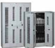
Bi-Fold Weapons Racks