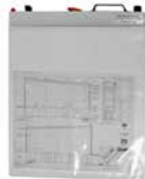
Multifile Plan Bags Heavy Duty