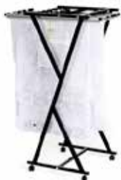
Multifile Standard A1 + A0 Plan Mobile Racks & Clamps