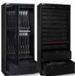
Tambour Door Cabinets