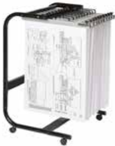
Multifile Premium Plan Racks