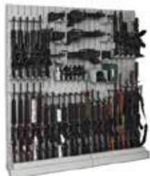
Expandable Weapons Storage