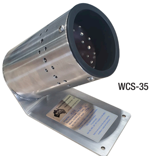
For Bench mounting use 2 fasteners to secure