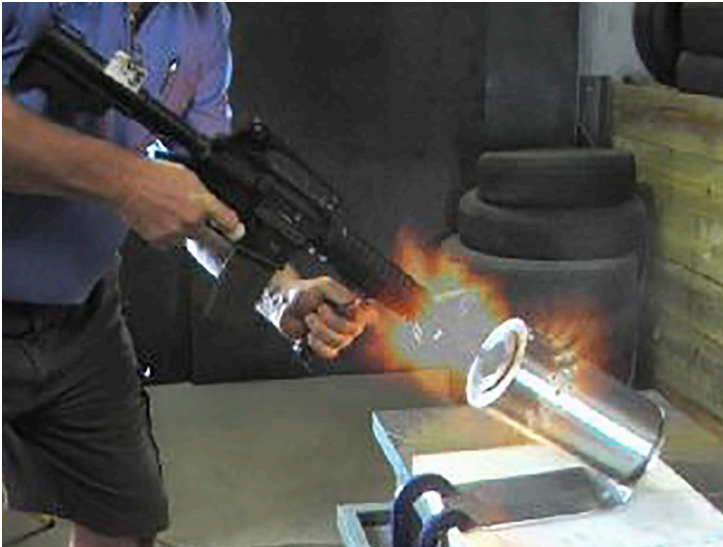
WCS-50 on quick detach Pedestal mount.