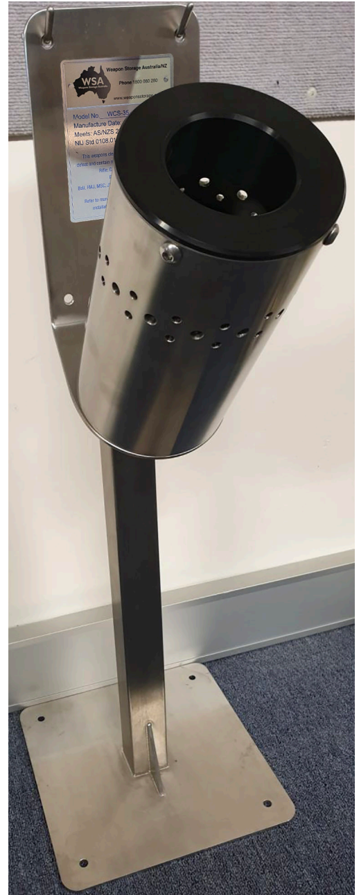
WCS-50 on quick detach Pedestal mount.