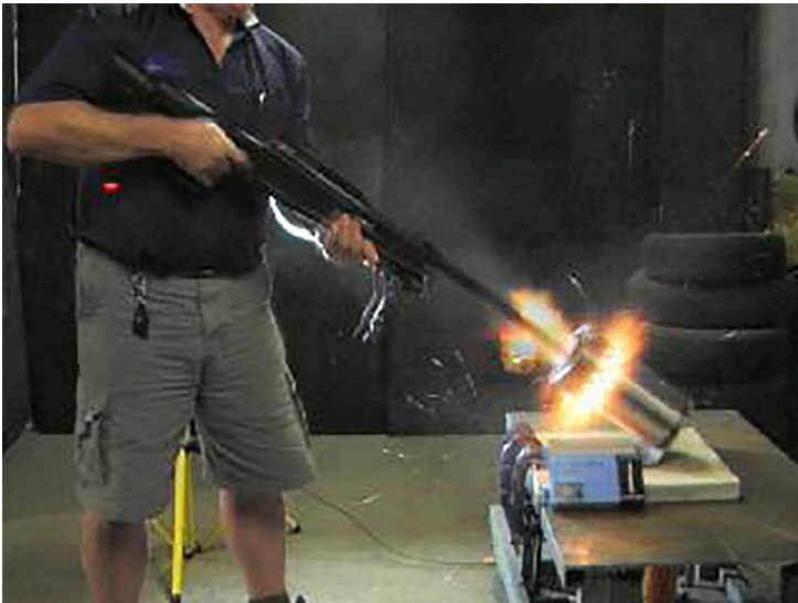
Blaser Sniper Rifle, 0.338 Lapua Magnum APWC (Tungsten core) M16 Carbine full auto